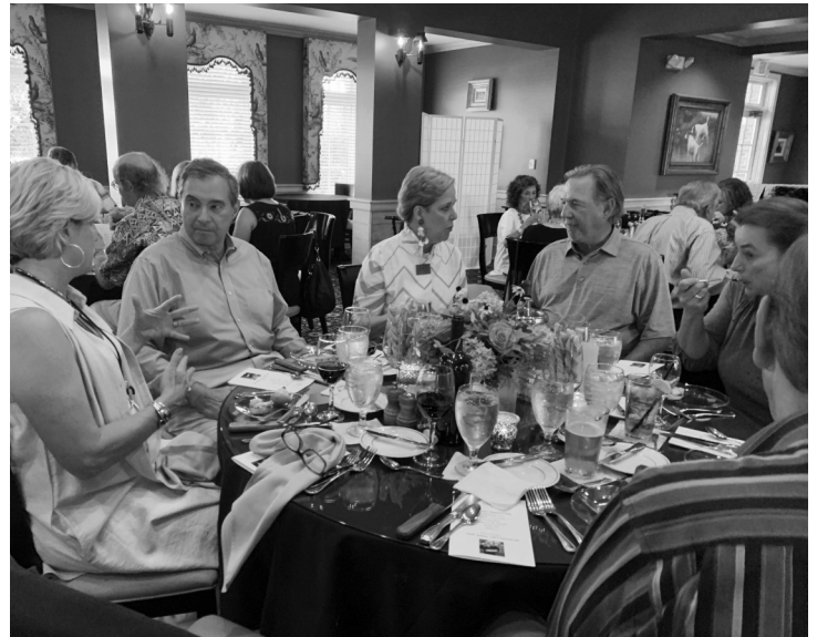
Our First Guest Chef Dinner

All food and beverage must be purchased from the Club. No outside food or beverage is permitted.