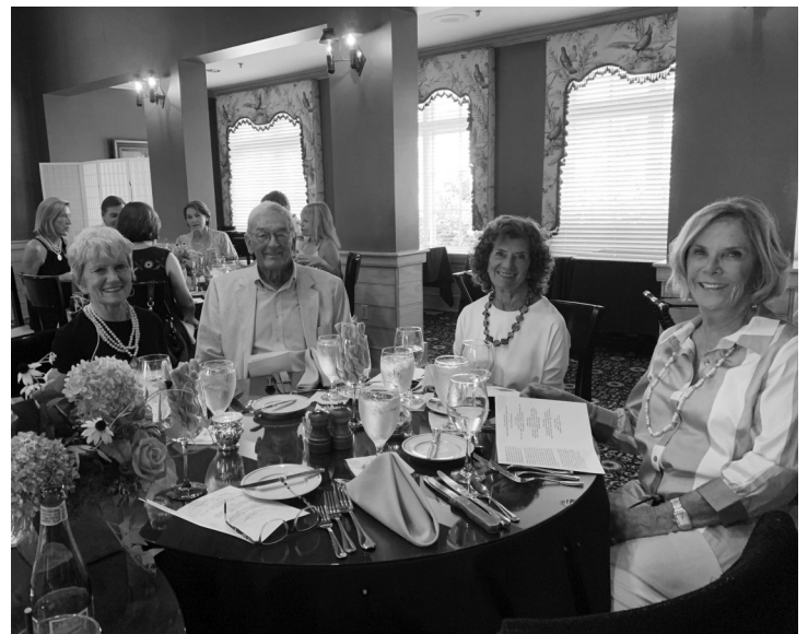
Guest Chef Dinner in August